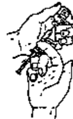
Tapping syringe to release air bubbles

It is quite normal to feel a bit nervous about giving yourself an injection. Only by doing it once or twice will you truly be able to tell if this feeling will pass or if this method is simply not for you. If you follow the directions below, you should be able to give yourself an injection into your penis with relative safety.