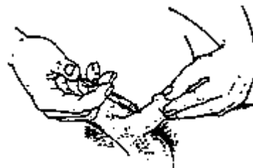
Injecting the contents of the syringe

Remove either your thumb or first finger from the syringe while still holding it with the rest of your hand. Use that finger to slowly but firmly inject the medication into your penis. Injection should be painless and should meet little resistance. If you meet resistance, gently pull the syringe out \frac{1}{4} " and try again. If you still meet resistance, remove the needle and try again.