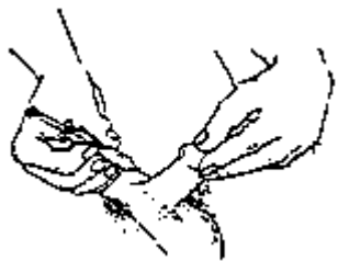
Inserting the needle into the penis

Now, use your wrist to "poke" the needle straight through the skin and into the penis. You will feel some resistance when you do this; that is OK. Remember to keep the needle at a right angle to the surface of the skin of the penis.