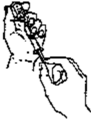
Injecting and removing fluid from vial

If necessary, you can remove bubbles from the bottom of the syringe by tapping it with your finger. You can also check for air bubbles by laying the syringe on its side across the top of a cup. After you refill, check again. If you have difficulty seeing the air bubbles, seeing the numbers on the syringe, or handling the syringe itself, ask the physician for assistance.